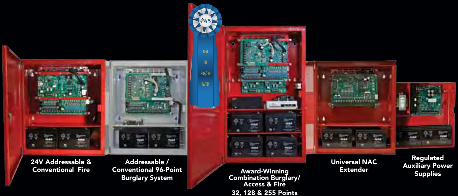
24V Addressable & Conventional Fire